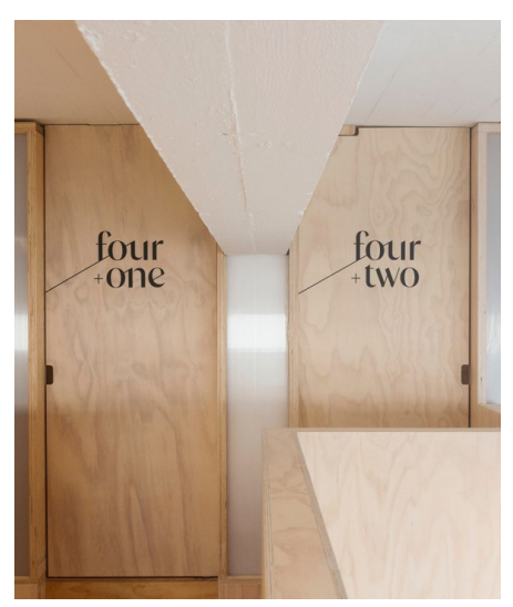
CV300 Series™ is a high-end multipurpose cut vinyl suitable for letterings and decals on walls, windows and other storefronts.